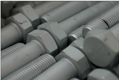
High Grade Metals